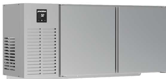
HWU211-UDD with optional solid doors

Waste Heat Recovery Condensate Vaporiser System